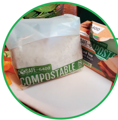
Compostable Fold Top Sandwich Bag FTS-18R