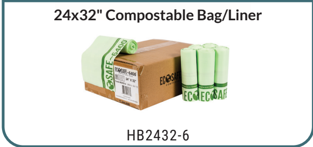
24x32" Compostable Bag/Liner