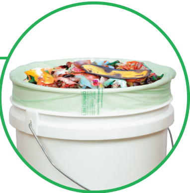
18.25/25" Compostable Bag/Liner HB1825-6 Pictured in Standard 5-Gallon Pail