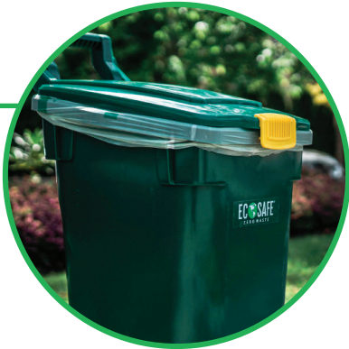
26x36" Compostable Bag/liner HB2636-8