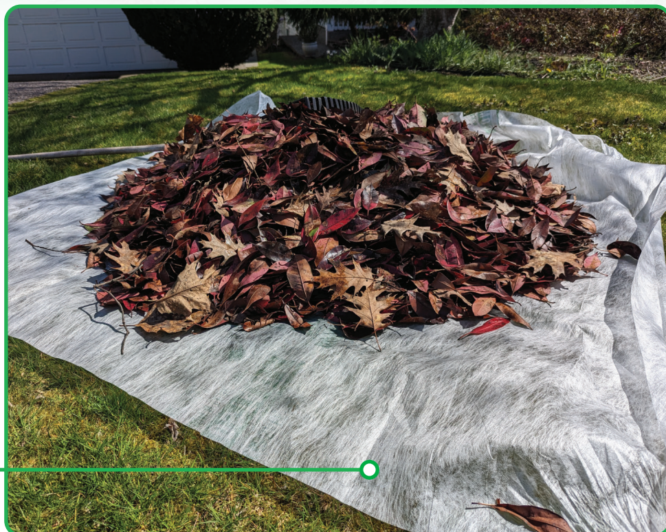
Compostable Lawn & Leaf Tarp CNW-LT7272