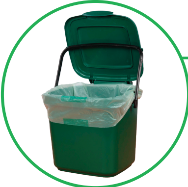
16x17" Compostable Bag/Liner HB1617-86 Pictured in EcoSafe® Kitchen Caddy