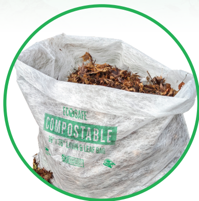
Compostable Lawn & Leaf Bag CNW-LT3936