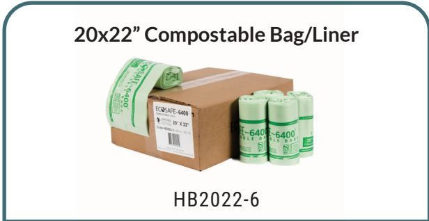
20x22" Compostable Bag/Liner