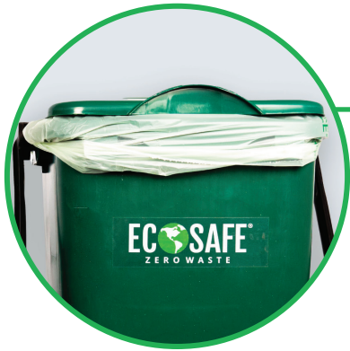
21x25" Compostable Bag/Liner HB2125-6