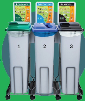
EcoStation Sorting System