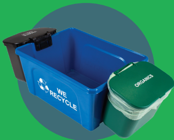
Busch Bins System