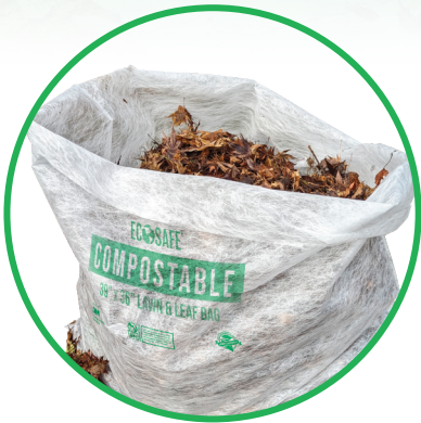
Compostable Lawn & Leaf Bag CNW-LT3936