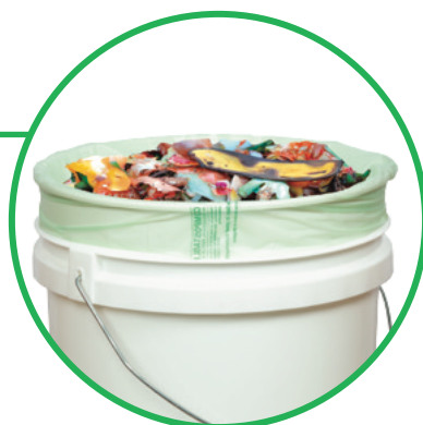
18.25/25" Compostable Bag/Liner HB1825-6 Pictured in Standard 5-Gallon Pail