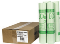
54x60" Compostable Bag/Liner