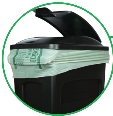
30x39" Compostable Bag/Liner HB3039-8 and HB3039-11

Pictured in Rubbermaid Vented Slim Jim 16G