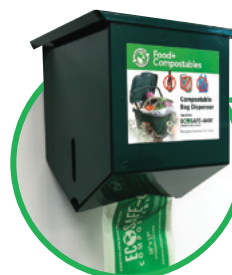
Compostable Bag Dispenser - MultiRes® MFRD-1 *for HR1617-6