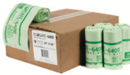
42x60" Compostable Bag/Liner