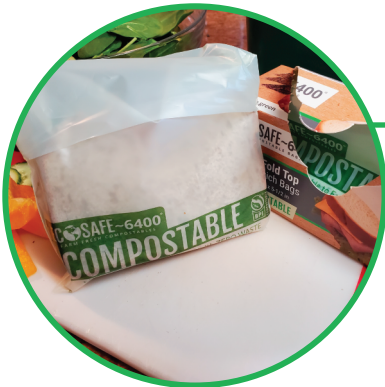
Compostable Fold Top Sandwich Bag FTS-18R