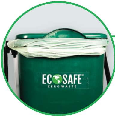
21x25" Compostable Bag/Liner HB2125-6 Pictured in EcoSafe® EcoCaddy