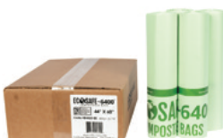
44x60" Compostable Bag/Liner