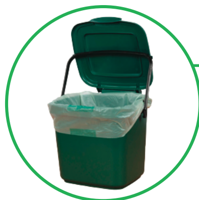
16x17" Compostable Bag/Liner HB1617-86 Pictured in EcoSafe® Kitchen Caddy