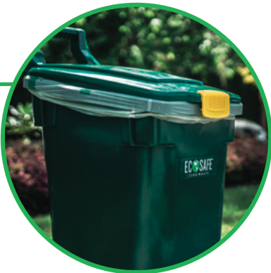
26x36" Compostable Bag/liner HB2636-8 Pictured in EcoSafe® Curbside Cart