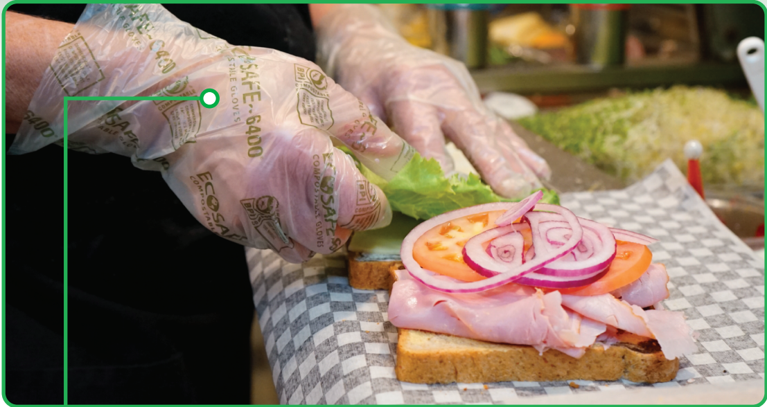
Compostable Food Prep Glove