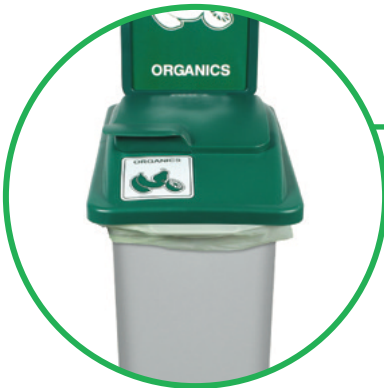
28x44" Compostable Bag/Liner HB2844-8 EcoSafe® EcoStation