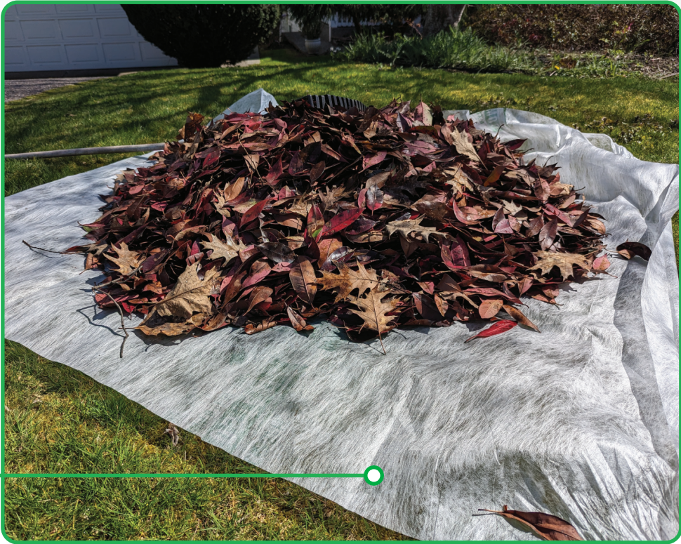
Compostable Lawn & Leaf Tarp CNW-LT7272