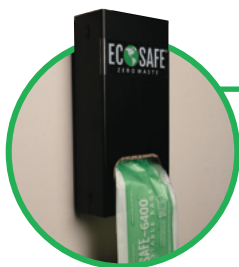
Compostable Bag Dispenser - Club Pack CPD-1 *for CP1617-6